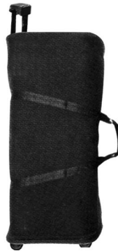
a) Nylon Bag