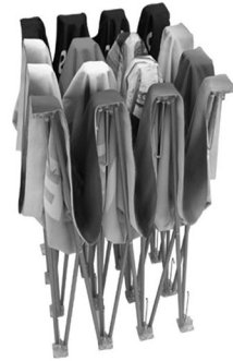
b) Aluminum Frame